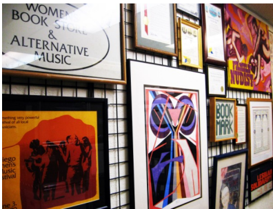
Special thanks to volunteer Keith for installing our wall racks!