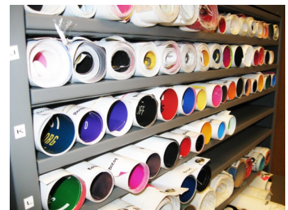
200 vinyl and paper banners rolled, numbered, and stored

(See the ARCHIVIST'S REPORT on page 3 for more)