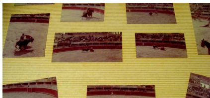
DON'T! Sticky albums turn acidic

When stored at 66°F and 35% humidity the average life expectancy of most photos is 75 years. Warmer and damper conditions hasten the aging process, and natural threats such as mold can attack overnight.