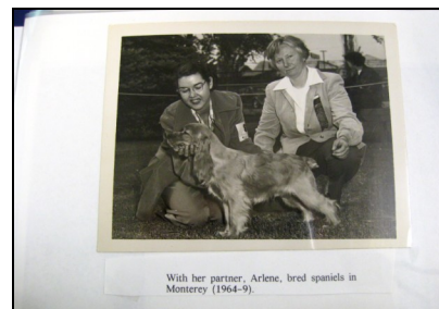
DO! Use plastic sheets, acid-free paper, and write captions

Right now you know who your friends are and which family photo was snapped on which holiday, but twenty years from now? Fifty? Jotting down names and dates can transform any album into a priceless scrapbook. And