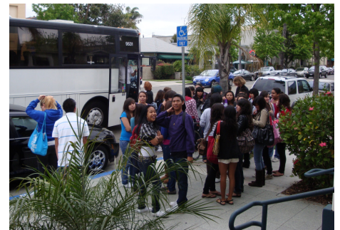
GSA bus arrival in the morning.

The visitors gave as well as received during the four hours of events. Various students brought their schools' GSA posters and T-shirts to start a GSA collection at Lambda Archives. Posters from the No on 6 vote of the 70s had introduced students to a piece of San Diego's past they had never experienced. And materials donated by the students stitched the history they create today into the history of their community that's been fighting for equality for decades. Students and teachers also brought coins to contribute over $80 to the "Penny Drive," Gamma Rho Lambda's fundraiser for the Archives.