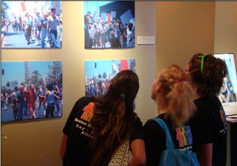
Mission Bay High School Gay Straight Alliance girls are absorbed by 1970's San Diego LGBT history.