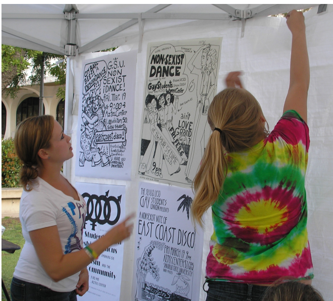
SDSU student volunteers set up Pride at State's exhibit in May.