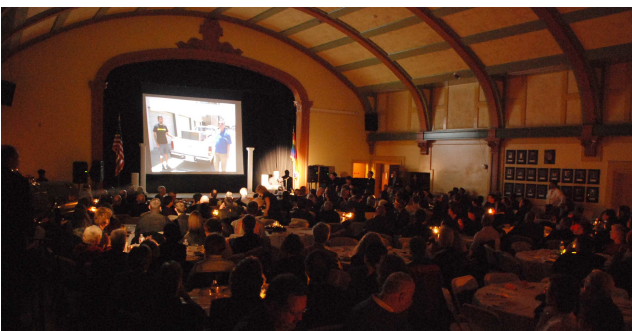
It's a full house at The Center.

Dozens of volunteers worked hard, including students. Students also had the honor of handing the honorees their awards.