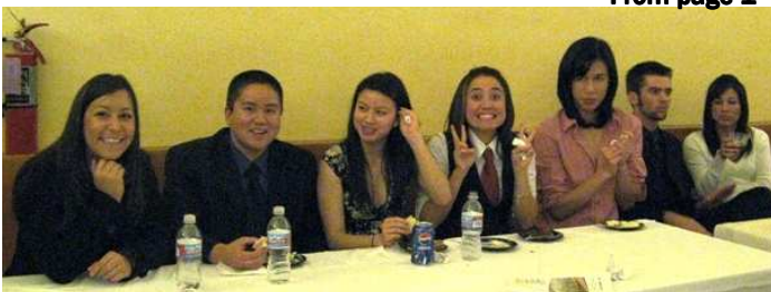
Gala SDSU student volunteers finally get a moment to relax.

It was clear that those in attendance cared deeply for the 20 Heroes and for Lambda Archives. The audience laughed and cried