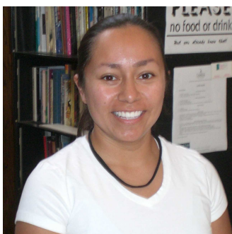
New Board Member